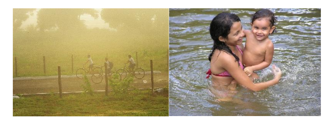
Brazilian backlands. Illustrations of fundamental nutrition, which includes basic education, and elemental nutrition, which includes clean safe water

populations, we need to think about earth (land) and also fire (energy), air and water. Or, to state this in another way: in the full sense of the word, nutrition is political.